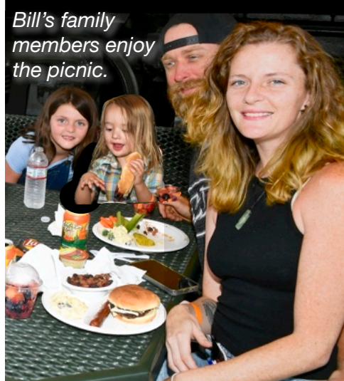
Bill's family members enjoy the picnic.