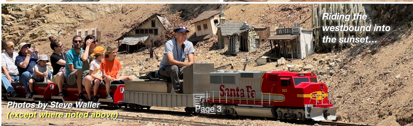
Riding the westbound into the sunset...