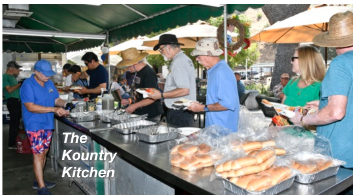
The Kountry Kitchen