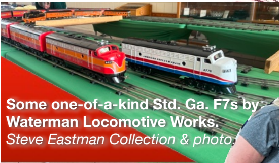
Some one-of-a-kind Std. Ga. F7s by Waterman Locomotive Works.