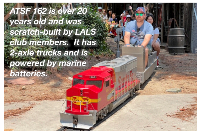
ATSF 162 is over 20 years old and was scratch-built by LALS club members. It has 2-axle trucks and is powered by marine batteries.