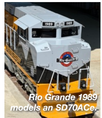
Rio Grande 1989 models an SD70ACe.