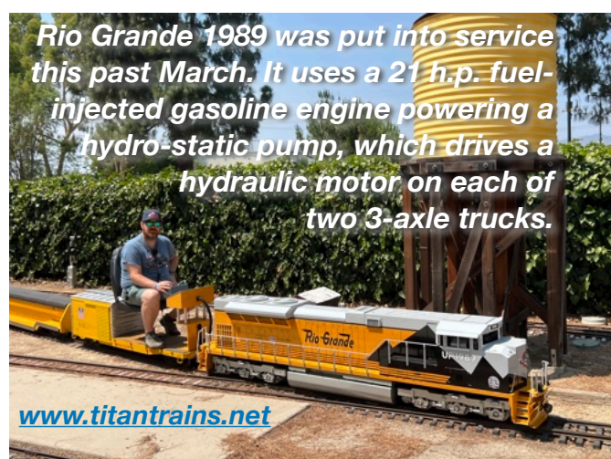
Rio Grande 1989 was put into service this past March. It uses a 21 h.p. fuel-injected gasoline engine powering a hydro-static pump, which drives a hydraulic motor on each of two 3-axle trucks.