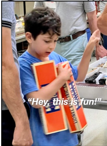
"Hey, this is fun!"