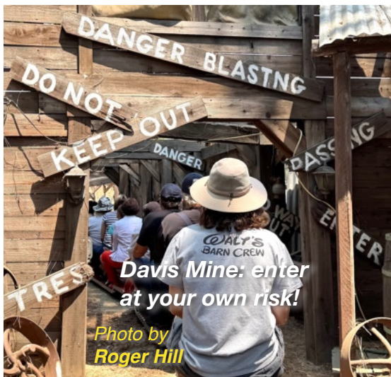
Davis Mine: enter at your own risk!