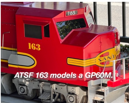
ATSF 163 models a GP60M.