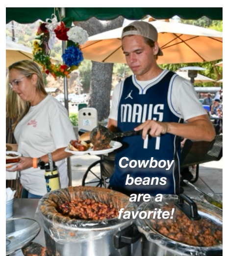
Cowboy beans are a favorite!