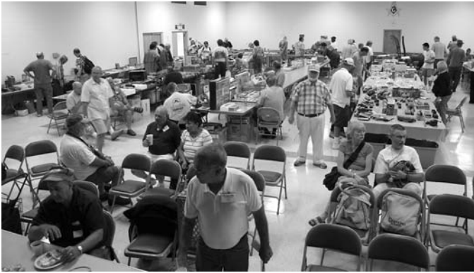
September Table Sales