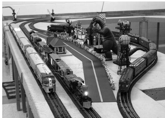
Look out, trains! The giant lizard is about to leap!!!