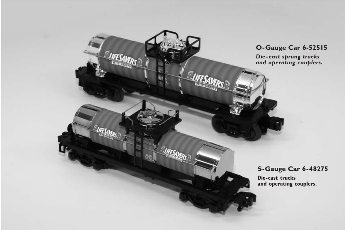
O-Gauge Car 6-52515 Die-cast sprung trucks and operating couplers.