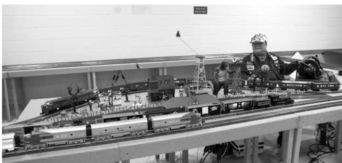
The Southwestern Division Layout at the October Meet featured a Halloween theme, including a Halloween Train, Haunted Mansion, skeletons, ghouls, and a menacing giant lizard preparing to attack! Above, Franklin Froloff at the controls.