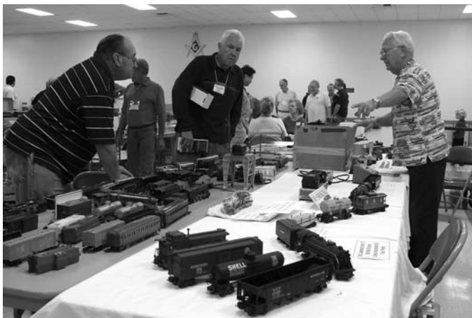
Table Sales at the October Meet.