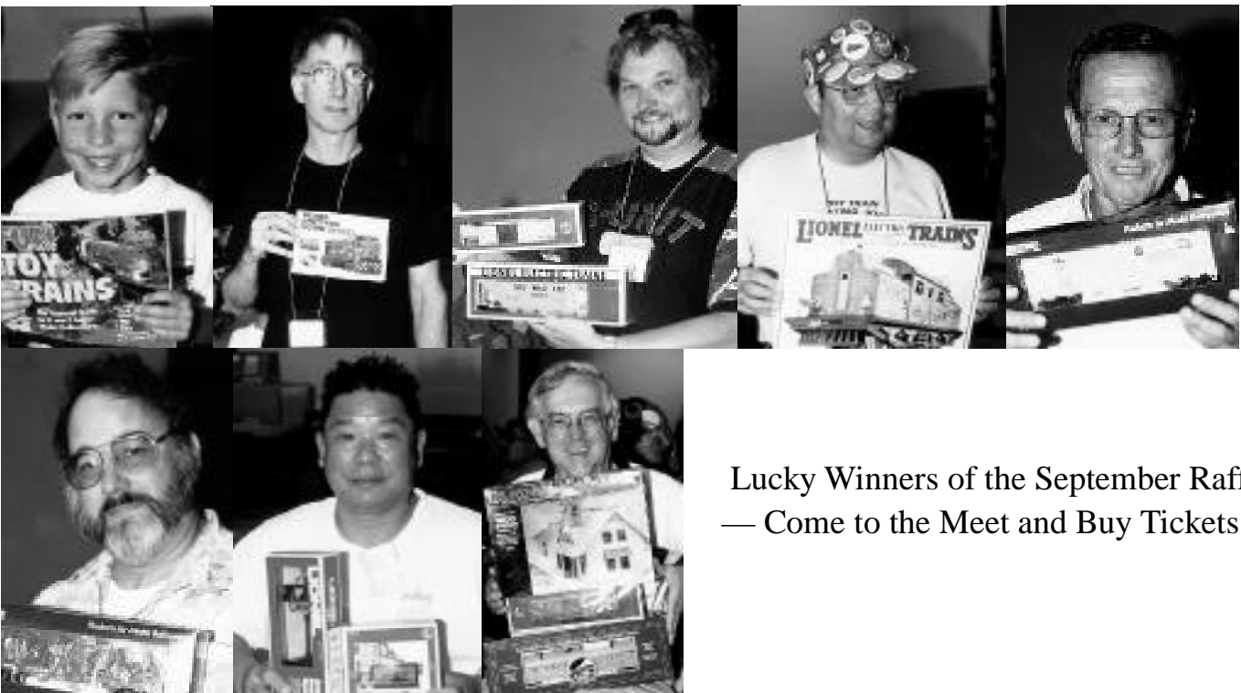
Lucky Winners of the September Raffle — Come to the Meet and Buy Tickets —