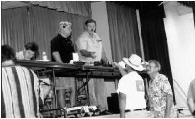
The Auction was busy in September!