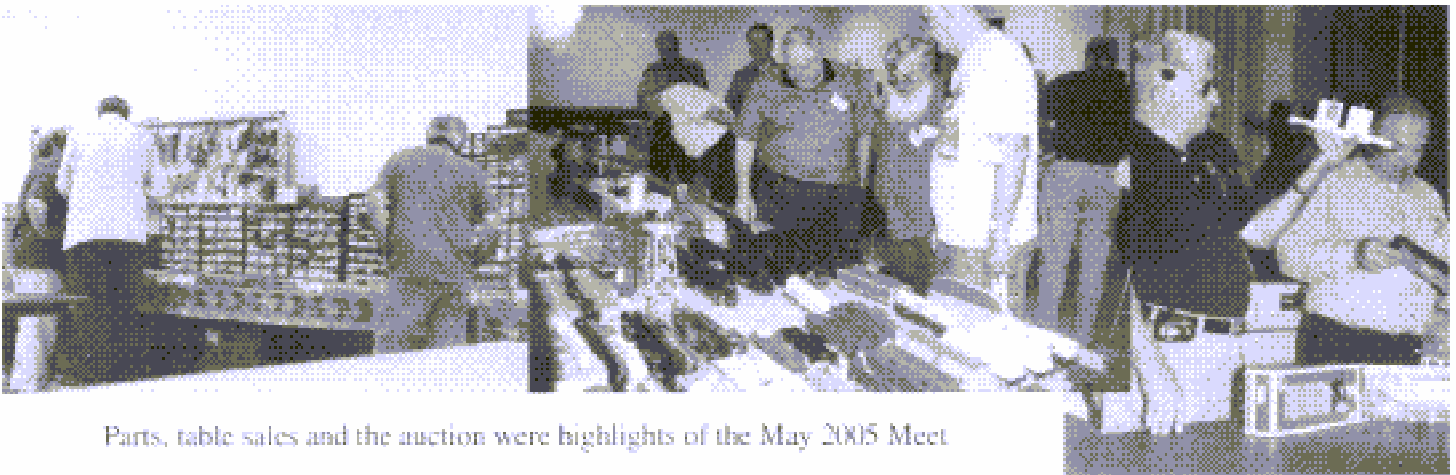
Parts, table sales and the auction were highlights of the May 2015 Meet