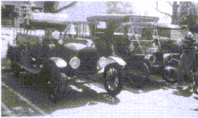
The Horseless Carriage Club of Southern California invited our Giant Open House Meet in the Club's April 3rd tour stops. SWD members and guests enjoyed checking out the many vintage automobiles in the parking lot.