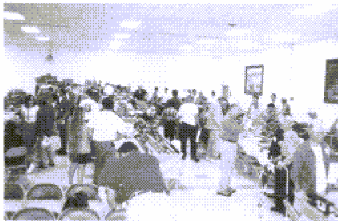
Members and visitors enjoyed tables filled with trains and train related items. Gauges represented included B&O, O. N., and Standard. Parts and colorful train t-shirts added more variety to the trading hall.