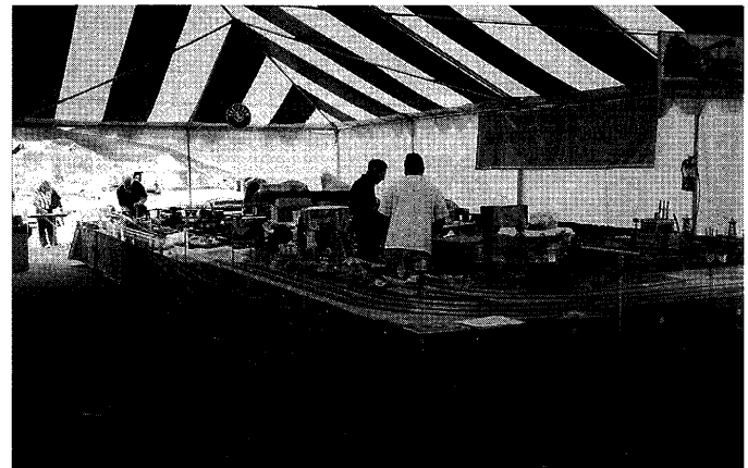
The 16 x 40 layout was on display at the recent Fullerton Railroad Days held in early May.