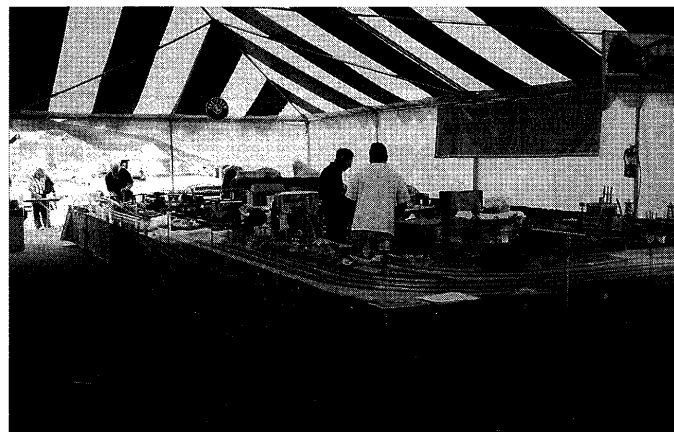
The 16 x 40 layout was on display at the recent Fullerton Railroad Days held in early May.